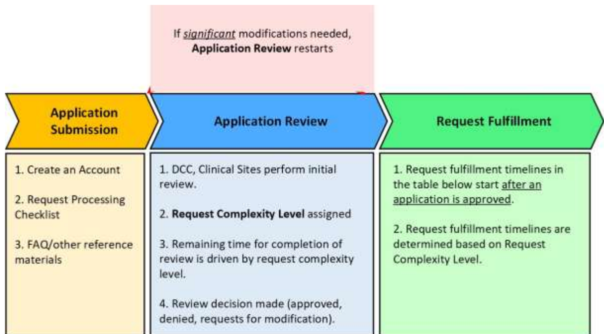
Figure 1: NNTC Request Process Overview

Once you have submitted a complete application to the NNTC, your application will enter the review and approval process. To be considered approved, a new NNTC application must navigate all elements of the review process, as described below: